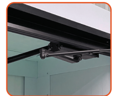
HYDRAULIC DOOR CLOSURE