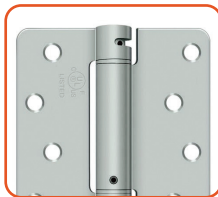
4 HINGE SYSTEM